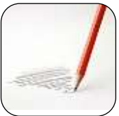
Illustration for Learning with Leeds College of Art

The day will include a strategic overview of the role and will cover whole school development, progression and assessment. Suitable for Art subject leaders